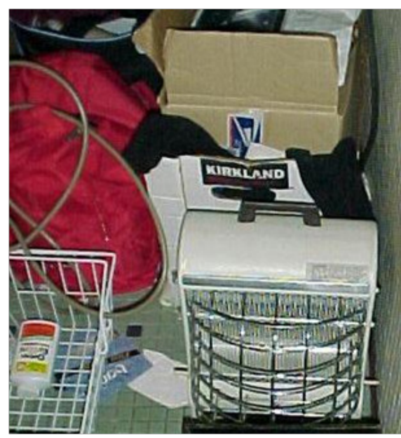
Figure 1: Space heater surrounded by combustible materials

Although space heaters appear to be harmless to some, many hazards can still exist no matter where they are used. In 2005-2009, space heaters caused 32% of home heating fires or structural fires and resulted in thousands of injuries as well as civilian deaths. (See "Fast Stats" on Page 3) The most serious hazards associated with space heaters are fire hazards. The majority of space heater fires are caused when combustibles (e.g. paper, clothing, and curtains) are placed too close or come in contact with the heater causing them to catch fire. Portable electric space heaters have a higher risk of fire than fixed electric heating devices.