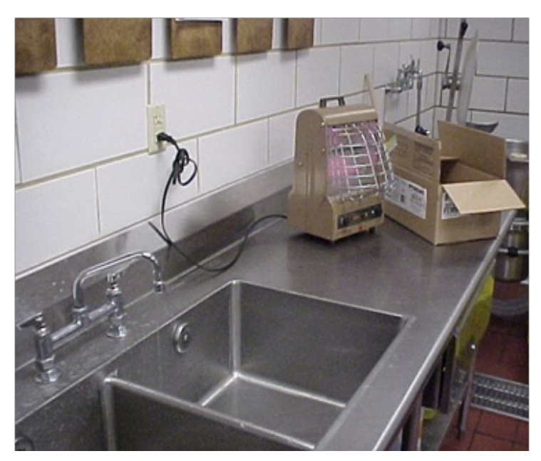
Figure 3: Space heaters should not be used near a sink, as seen above, or near combustible materials