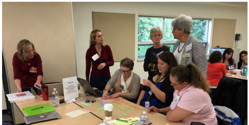
New Fellows Orientation: Fellows engaging in Making Change Happen , a simulation experience guiding participants through the challenges and rewards of becoming a change agent.

Join us! Apply Today: http://tinyurl.com/Fellows-Apply